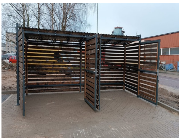
Waste Container Shed For 4 Large Containers