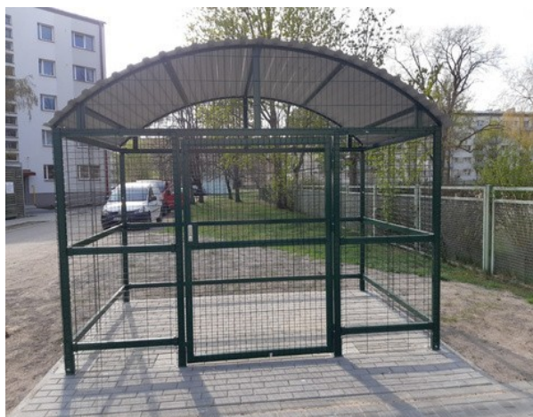
Waste Container Shed for 2 Large Containers (With Curved Roof)