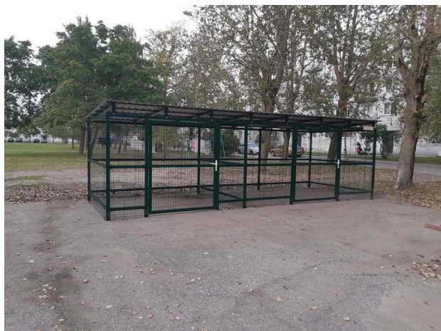
Waste Container Shed With Partitions