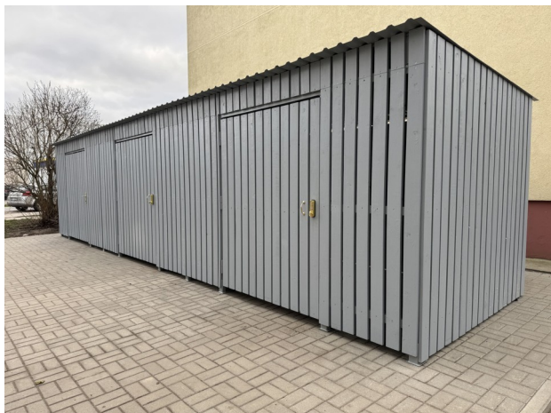
Waste Container Shed for 6 Large Containers with Partitions