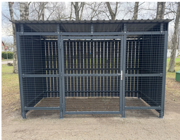
Waste Container Shed For 3 Large Containers